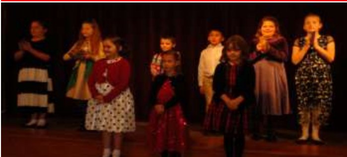
“Do You Hear What I Hear” performed by the First thru Fourth Grades.