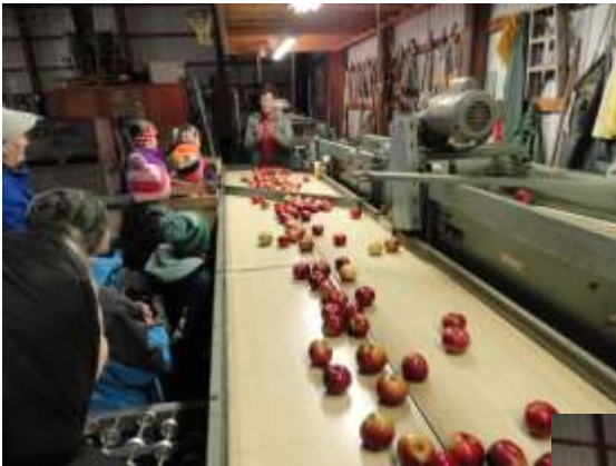
Their guide explained to them how they clean and package up the apples.