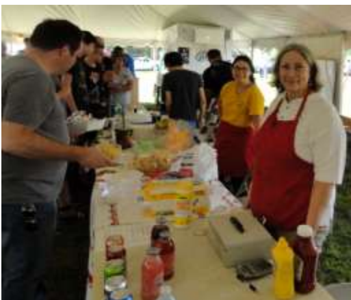
Food, Beer, Music, and Fun!!!

The Annual School fundraiser had another great turn out. Our 2020 Summerfest will be held Saturday August 22. Rain or shine. Like us on Facebook @ Sauter Racing Family Olden Days Car Show for more information.