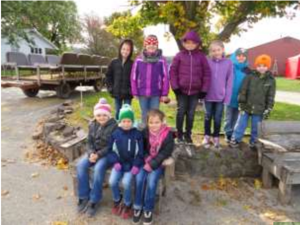
The 1st through 4th grades enjoyed a field trip to the Northwoods Orchard in Mauston, Wisconsin.