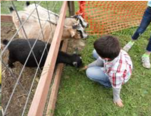
They enjoyed getting to meet the animals at the petting zoo on the Orchard.