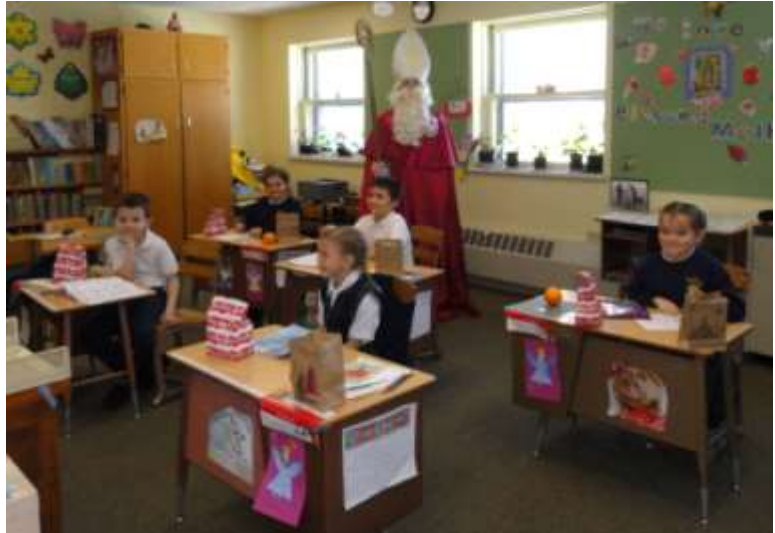
We had a surprise visit from Saint Nick and the kids enjoyed a goody bag with treats.