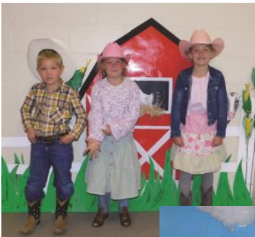
—Western Day— The Second Grade and High School were letting their true country style shine— cowboys, cowgirls, farmer, and Amish preacher.