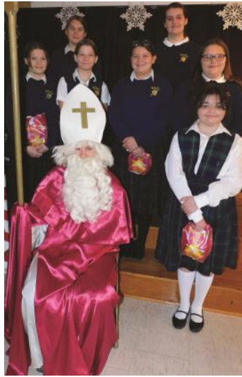
Jolly Old Saint Nick and the 5-8th grade girls.