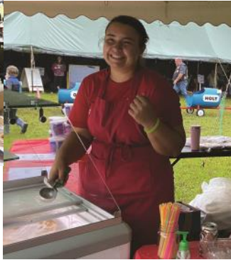
Miss Bires serving ice cream!