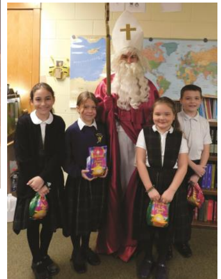
Looks like Saint Nick gave some goodies to the 3rd and 4th graders!