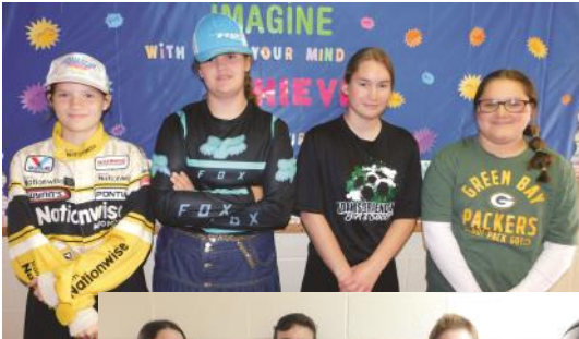
—Sports Day— Junior High and High School represented their favorite sport and team.