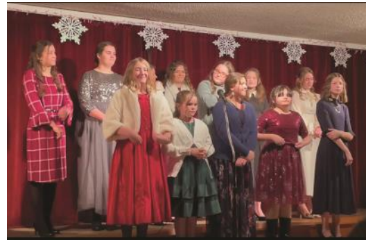
The 5-12th Grade girls singing the song "Glorious".

The Grades 2-4 acting in their skit "The Candy Shop". The stage was magically decorated into an enchanting land of candy and delight! However, each of the shop customers (students) left the shop with a candy cane and the reminder to 'Keep Christ in Christmas'.