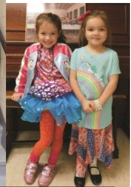
Decades Day The Kindergarten and High School represent the Roaring '20s and the tubular '80s.