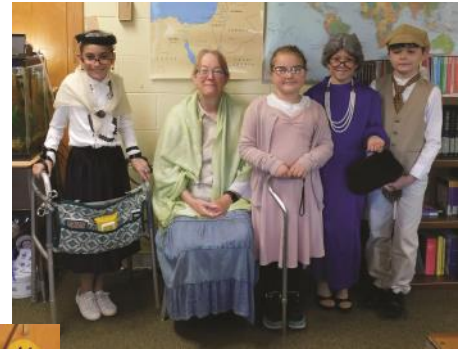
Senior Citizen Day The Third, Fourth, Fifth, and Sixth Grades are sporting their best elderly attire.