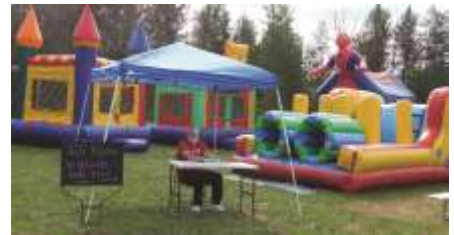
Bouncy Houses keep the kids busy all day.