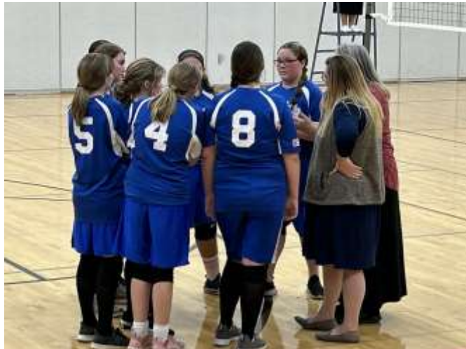
Coaches building the team up before the next game.

“I am super proud of these girls. All the practice paid off.