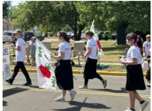
Crusaders walking in the 4th of July Parade, Adams WI