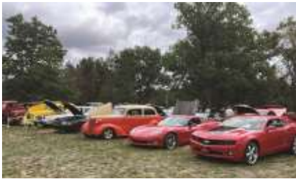
Over 135 old and new autos showcased at the car show.