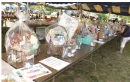
Over 20 Raffle Baskets this year. The most popular being the racing basket.