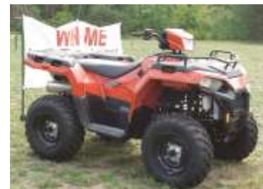
2023 Polaris Sportsman 570 ATV