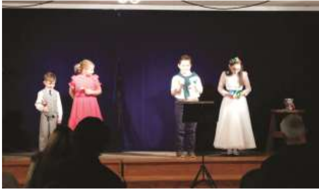
K-4 students playing O Come Little Children with their instrumental hand bells.