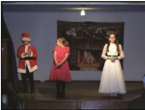
Twas the Night Before Christmas performed by grades 1-4.