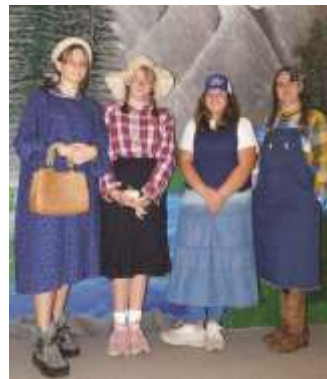
The 7th & 8th grade students pose on the country side for Hillbilly Day.