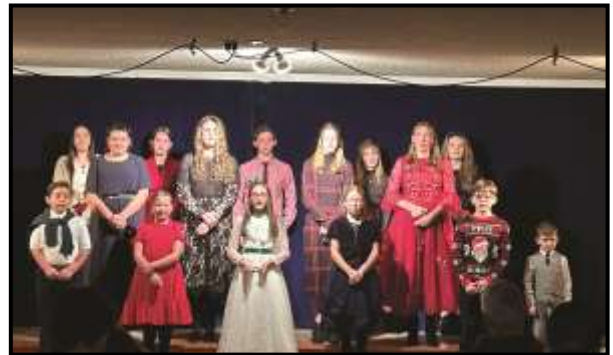
The whole student body sang together, Caroling, Caroling.