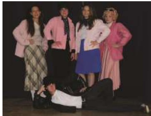
The High school students dressed as the pink ladies and a leather clad greaser.