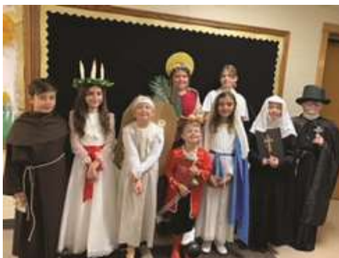
Grades K-7 dressed up as their favorite saint for the all saints day celebration.