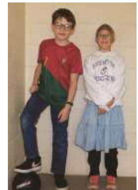
We had a surprise visit from the 5th grade soccer duo.