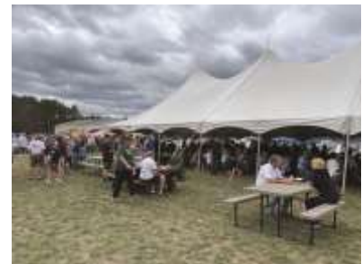
A large crowd enjoyed the cars, food and fun.