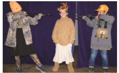
1st—4th grade were on the hunt for a nice deer.